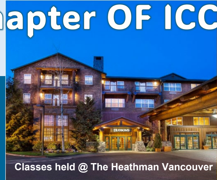
Classes held @ The Heathman Vancouver

*Inspectors *Plans Examiners *Building Officials *Fire Marshals *Designers *Architect *Contractors